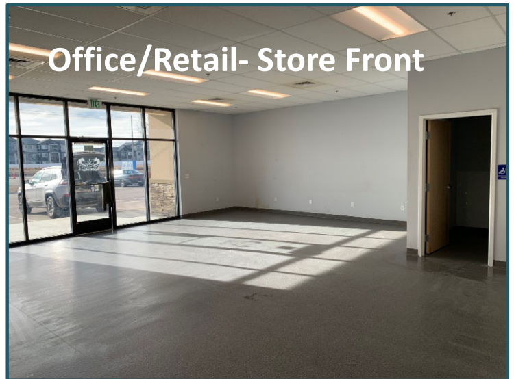
Office/Retail- Store Front