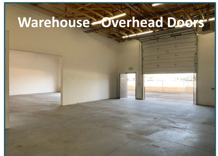
Warehouse - Overhead Doors